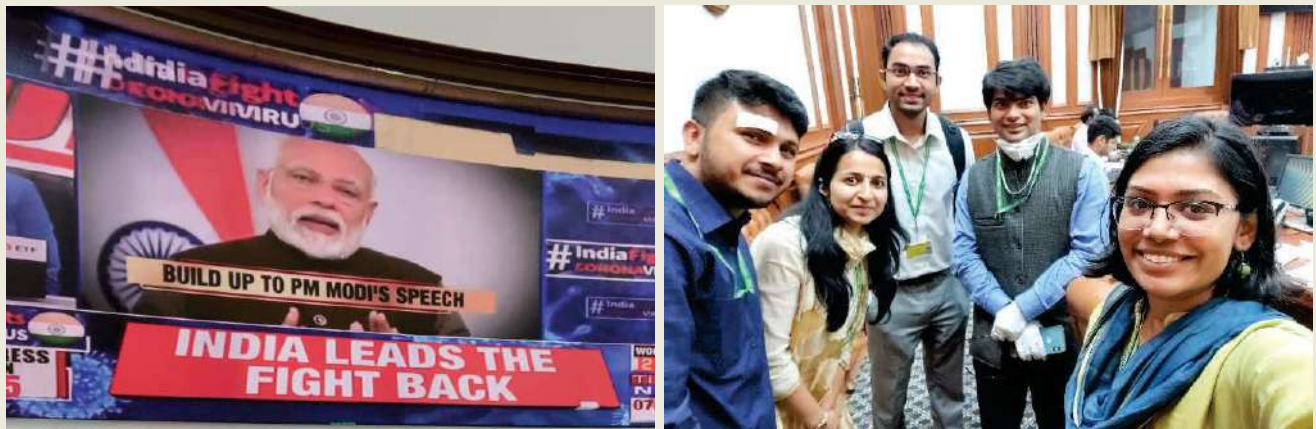
(Deployment of IFS OTs at COVID-19 Control Room, MEA, New Delhi)

Phase-II of ITP commenced on 15 June 2020 through webinar and is in progress.