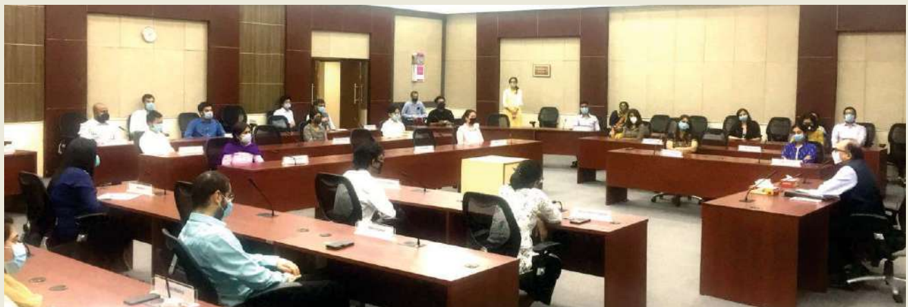
(Address by Dean (SSIFS) to IFS OTs in the Phase-II of ITP)