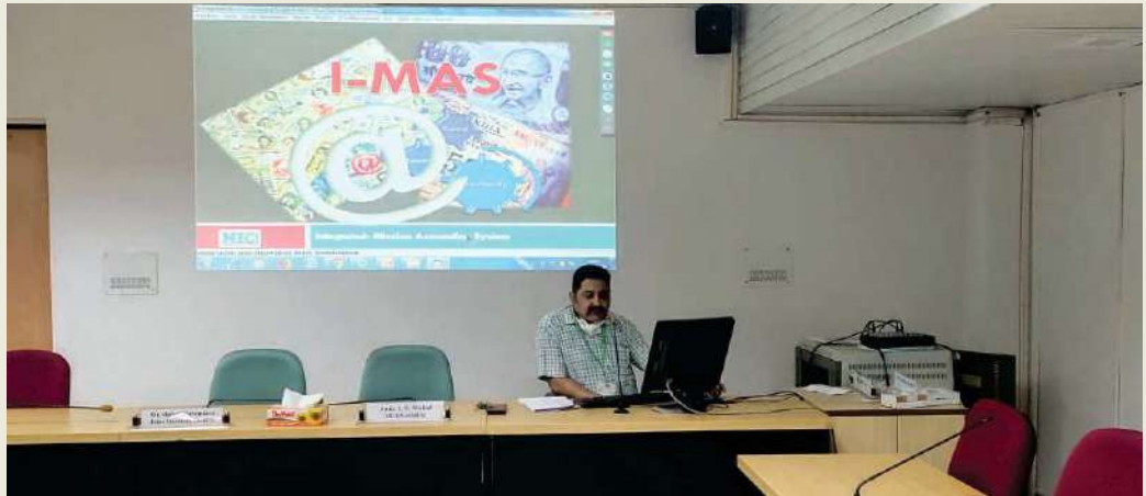
(Speaker addressing on webinar to participants of IMAS Training Programme)

A 1-day IVFRT (consular) training was conducted on 13 June through webinar. The training was attended by 51 participants.